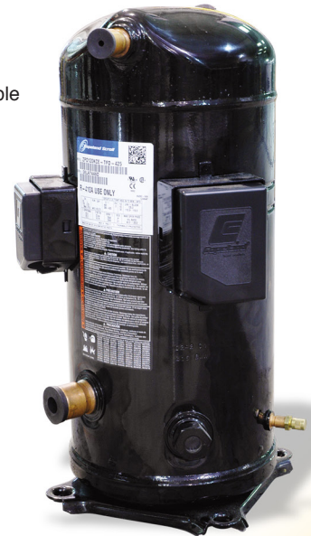
Typical digital scroll compressor.

For More Information ... call 317-887-6352 Since 1989 ... PRICE & PERFORMANCE .... for the LONG TERM !