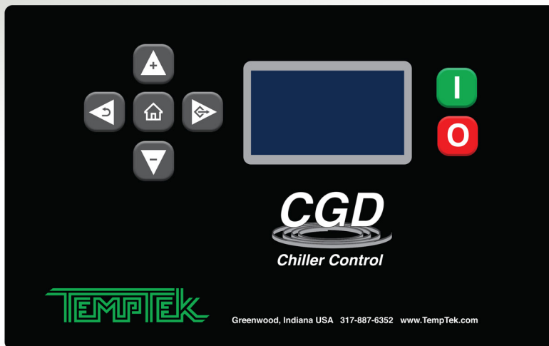
Control instrument for portable chillers with Digital Scroll Compressors.