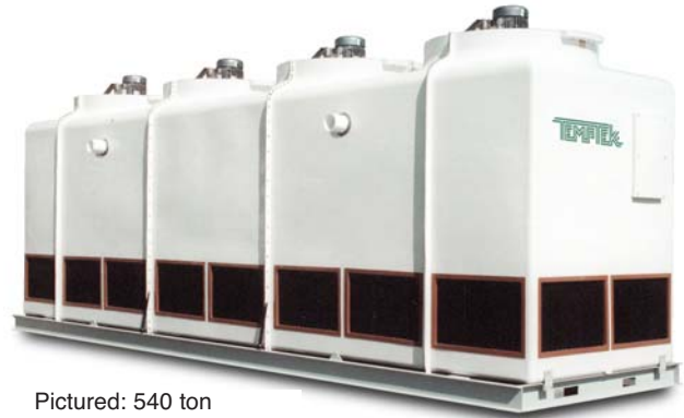
Pictured: 540 ton TP Series cooling tower