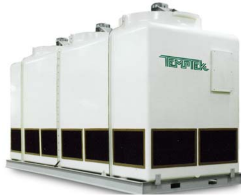
Pictured: 405 ton TP Series cooling tower