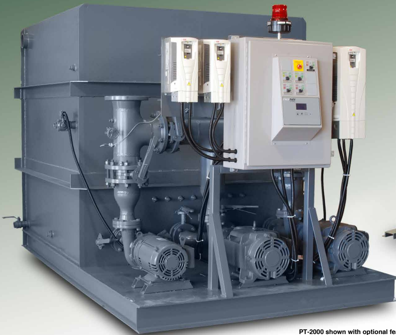
PT-2000 shown with optional features: • Standby pump and manifold • Central control console • Pressure and temperature alarm system • Electric water make-up system • Variable Speed Drives