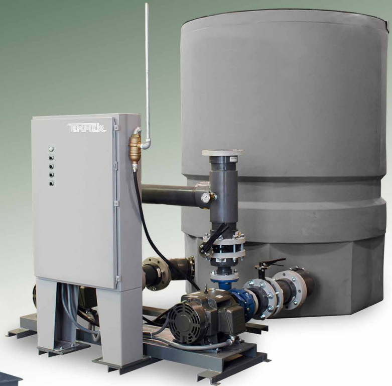
PPT-1500-2P shown with these optional features: • Central control console • Electric water make-up system